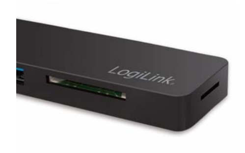
Support two memory cards at the same time