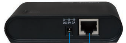
POWER PORT LINK PORT