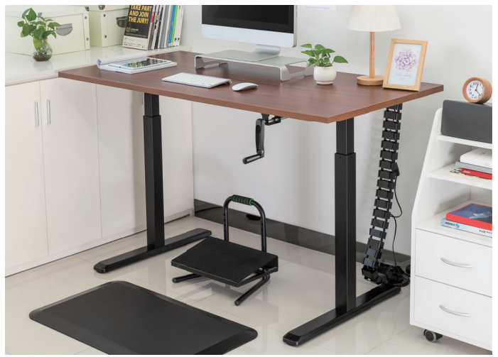
Width adjustable fitting a variety of desktop shapes and sizes