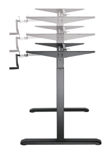
Manual height adjustable desk