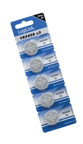
5pcs per card