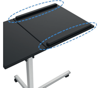
Raised edge keeps your device from sliding off