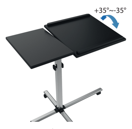
shelf can be tilted 35°up and down