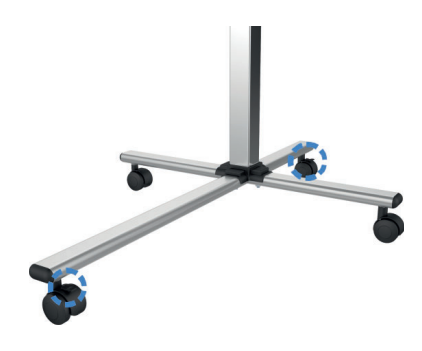
casters offer maximum stability (2 lockable)