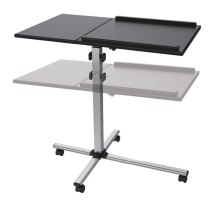
Height adjustment satisfies different preference